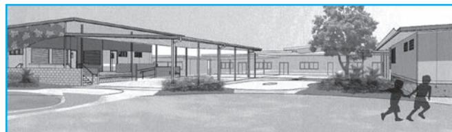
TOP: the plan; ABOVE: New kitchen building (left) and admin building (right)